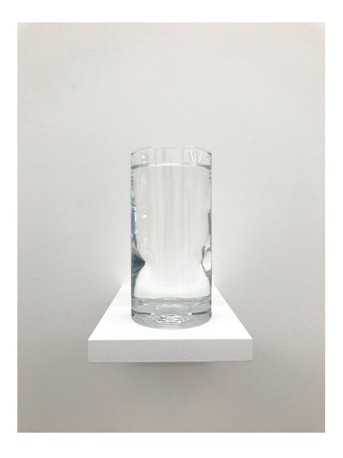
Pope.L's "Well (elh version)," a series of small ledges bearing water glasses that must be topped up with eyedroppers every day by gallery employees.

If you stare across the room at Ms. Vaughn's inspired display of discarded Chicago Transit Authority train seats, they look interchangeable, but on closer inspection, each seat reveals a distinct pattern of wear. Every two-and-a-half minutes exactly, Pope.L's "Pedestal," an upside-down water fountain bolted to the ceiling, releases a thin jet of water into a hole in the floor. It's a disquieting meditation on the nature of time — endlessly replenished but endlessly fleeting — made more ominous by "Well (elh version)," a series of small ledges bearing water glasses that must be topped up with eyedroppers every day by gallery staff.